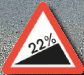
Percentage of BME users