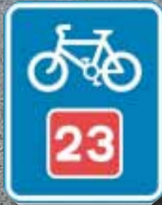
Number of bike rides